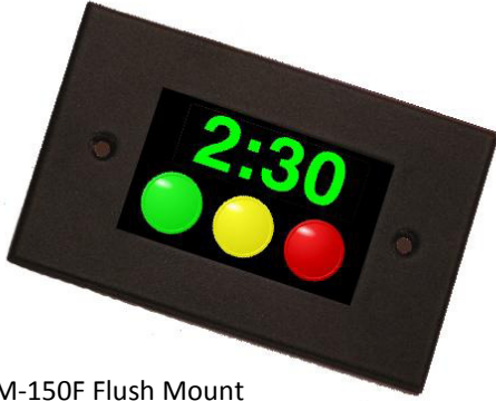
TDM-150F Flush Mount