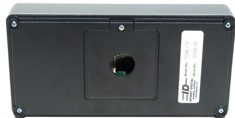
TDM-170 Rear View