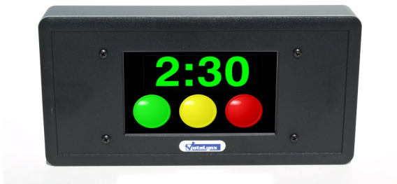
TDM-170 Front View

The front and rear views of the TDM-170 Timer Display are shown below: